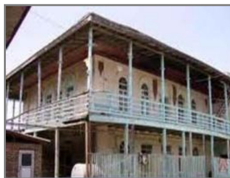
Figure 1: Using Wood in Warm and Humid Areas

In warm and humid areas, it is better to use the materials that have less thermal mass and don't store heat in themselves. Climatically, the basic problem is the extreme heat and it is not a right thing to store the warmth of day for night. Due to this fact wood is the best material in these areas since it transfers heat slowly and the absorbed heat during the day remains on the surface of wood and during the night with a relatively cool breeze it loses its heat [Viseh Sohrab et al., 1388].