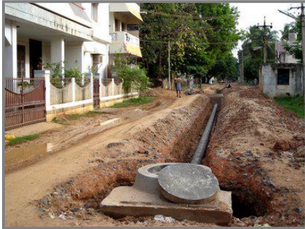
Figure 3: Soil as Substructure