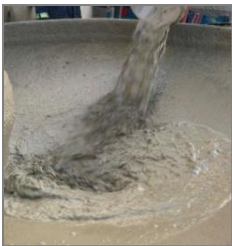
Figure 6: Concrete Preparation

Concrete is produced through the combination of water and cement and the reaction between them. Concrete along with steel is one of the most widely used construction and development materials which is utilized in building dams, bridges, houses, roads, streets and etc. nowadays, concrete and steel are extremely used in construction and development workshops. Concrete and steel structure are designed and built based on the type of application. The components of concrete are: cement (about 7-15%), water (about 14-21%), and rock grains (about 60-75%) [www.wikipy.com].