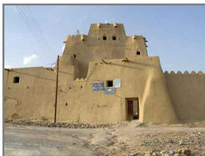
Figure 4: Using Adobe in Building

Using adobe has the following advantages: doesn't pollute ecosystem, is inexpensive, stores thermal mass, has the optimal heating transfer features for heating in the summer and cooling in the winter. Since soil is a suitable substance for construction and is available all around the world and regarding the fact that soil materials need the least amount of processing, production can be local and decentralized and construction can be done by a self-assistance method to reduce expenses. Adobe production only needs 1 percent of the energy required for producing brick and Portland cement. Construction by using adobe generally needs manpower, thus it helps domestic economy, reduces sound transmission, it is not toxic and also soil acts better in humidity balance in comparison with other traditional materials [Viseh Sohrab et al., 1388].